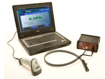
GEN III 300 Series