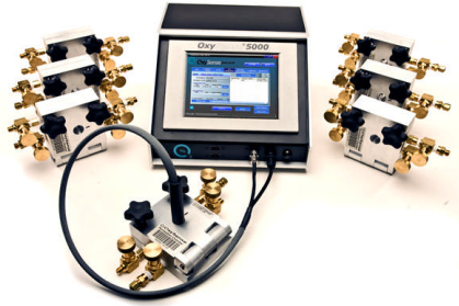
Film Permeation Set Up