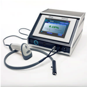
GEN III 5000 Series