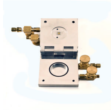
Permeation Chamber,(Pat. Pend)