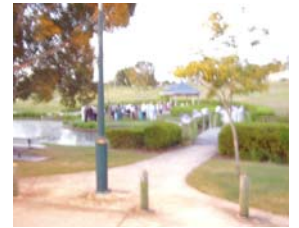
An example of a funeral ceremony being held in a park. This is called a “run out” in the funeral industry.

To have a non-traditional funeral for your loved one, you first need to find a funeral company with a “can do” attitude. I have worked with several such companies and can refer you to them if ever needed.