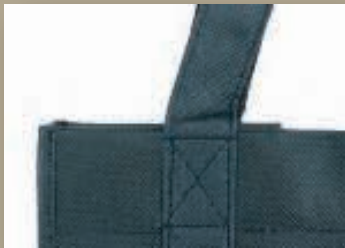
Reinforced Cross-stitched Handles

100% Recyclable Cost Effective Washable Reusable Lightweight Durable Hypoallergenic Non-toxic Water Repellent