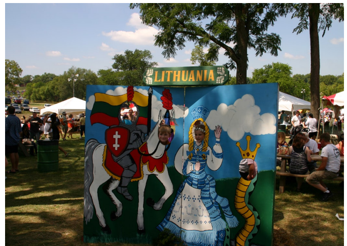
Children of one of our international military officers (and his spouse) pose at the Lithuanian photo board at Kansas City's annual ethnic enrichment festival

The directory currently includes more than 600 entries with organized links to: 1) area businesses, 2) organizations, 3) educational institutions, 4) individuals whose work and interests are international, 5) a calendar of local events including ethnic celebrations and educational programs and 6) connections to global businesses. Click on www.KansasCityGlobal.org and find out all there is to know about the exciting opportunities Kansas City Global has to offer!