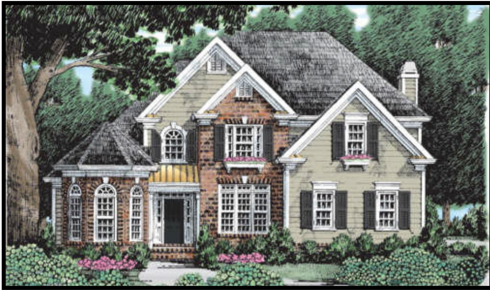
Frank Betz Rendered Drawing

3494 hsf - 4 Bed, 3 Bath 2 Bonus Rooms - 3 Car Garage