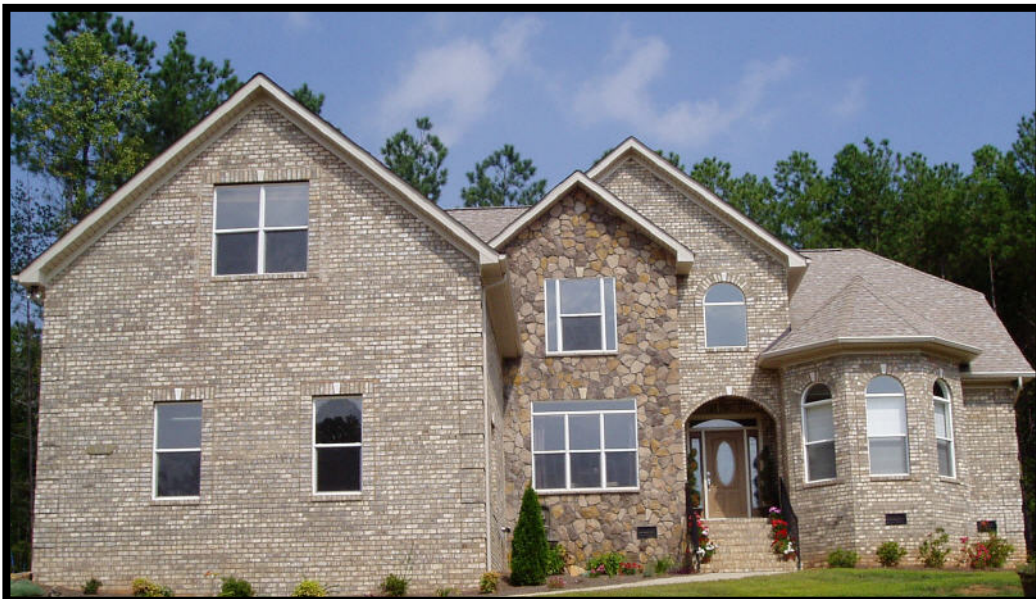
Finished Ambrose by Builder located in Watertree Landing