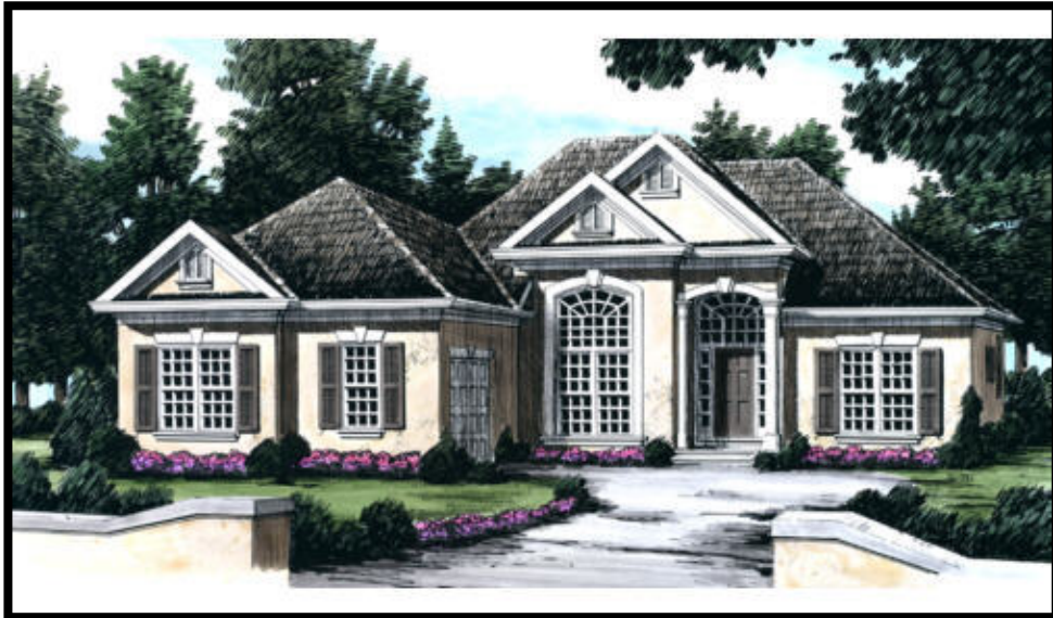
Frank Betz Rendered Drawing

3605 hsf - 3 Bed, 3.5 Bath 2 Bonus Rooms - 3 Car Garage