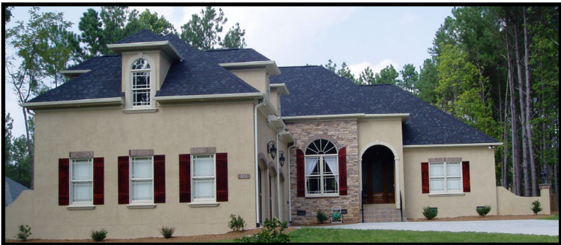
Finished Bagwell by Builder located in Watertree Landing