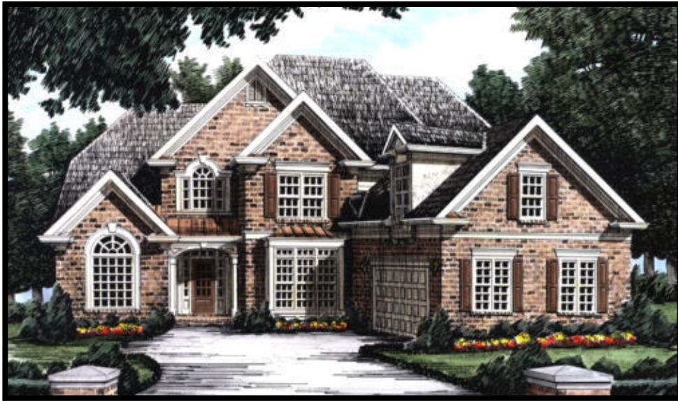
Frank Betz Rendered Drawing

3600 hsf - 4 Bed, 3.5 Bath 1 Bonus Room - 3 Car Garage