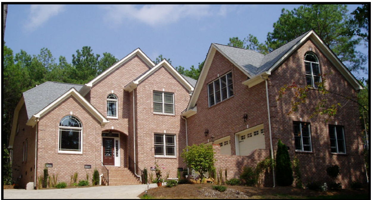
Finished Burnside by Builder located in Watertree Landing