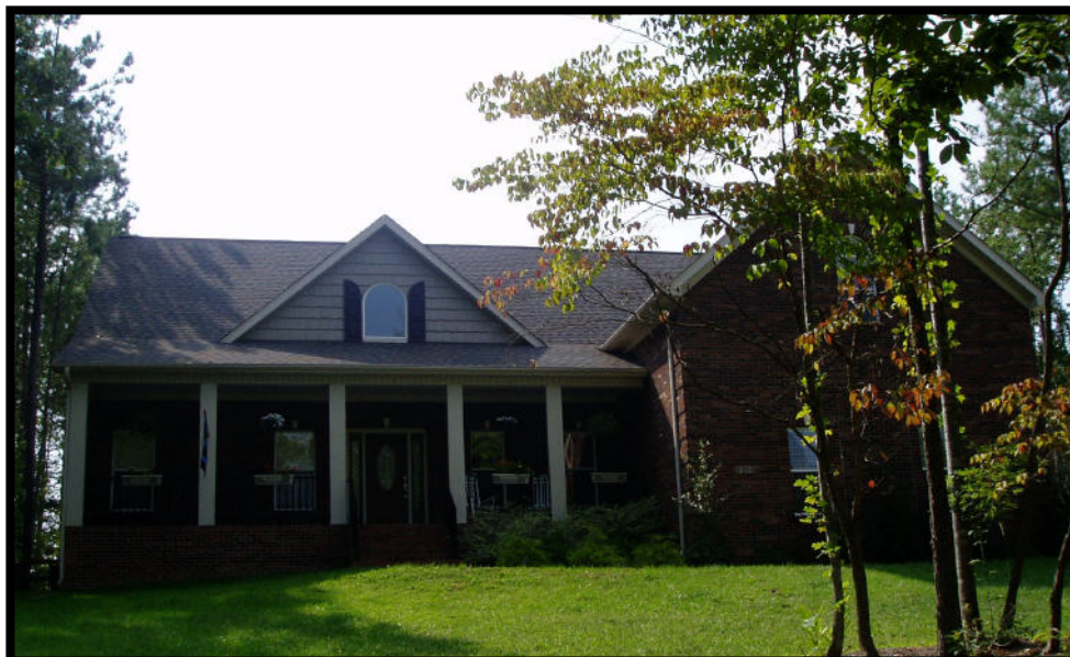
Finished Ambrose by Builder located in Watertree Landing