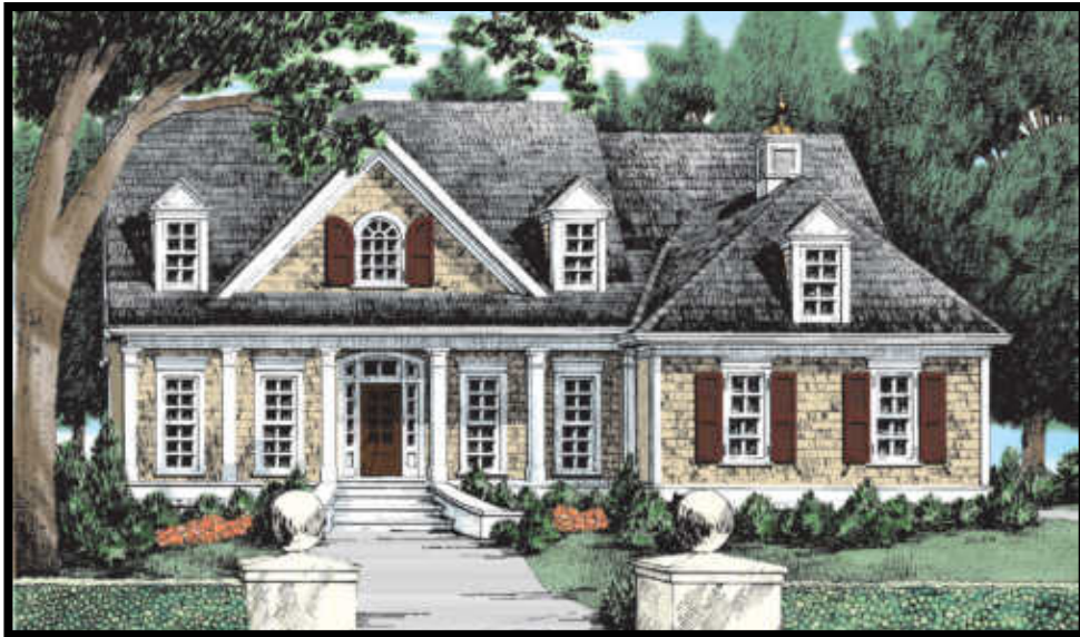
Frank Betz Rendered Drawing

3520 hsf - 4 Bed, 3 Bath 2 Bonus Rooms - 3 Car Garage