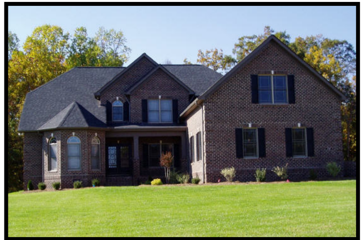
Finished Willowvan's by Builder located in Denver & Mooresville