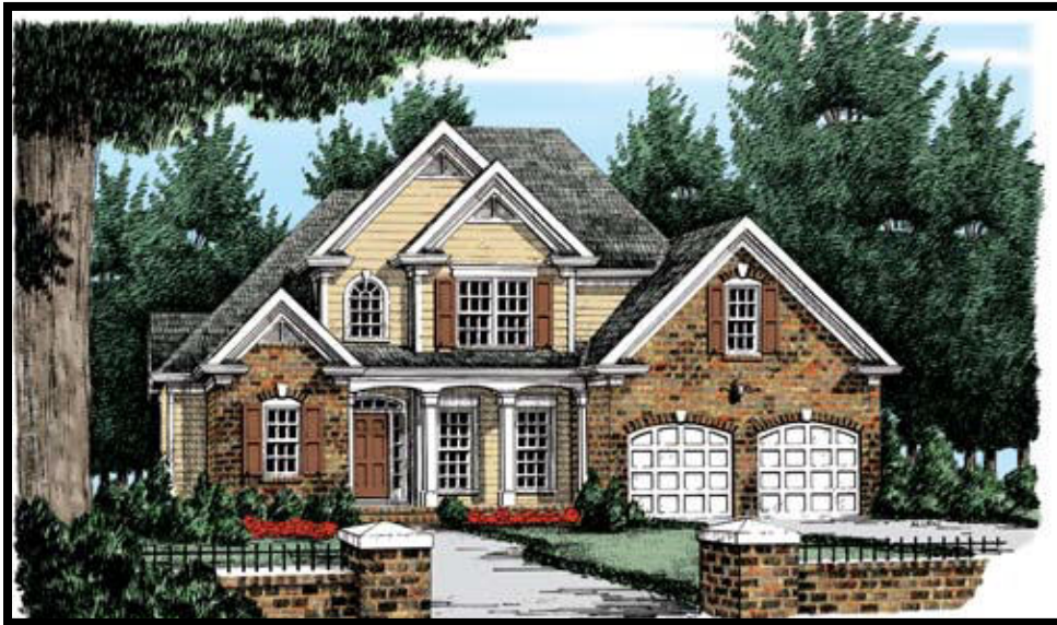
Frank Betz Rendered Drawing of Willow

3294 hsf - 3 Bed, 2.5 or 3.5 Bath 2 Bonus Rooms - 3 Car Garage