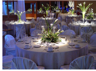
Table Pin Spot Lighting

These lights are placed on covered stands around the room and pointed towards the centre of each table to light up the centrepiece. They are a great way to add more ambient lighting to the room, and draw attention to each centrepiece on every table.