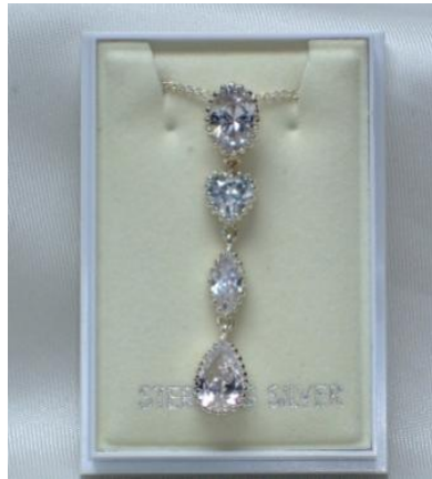
1727 – Sterling Silver Diamante Drop Necklace £16.99