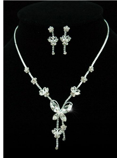
S1077 –Silver Plated Crystal Butterfly Necklace Set £18.99