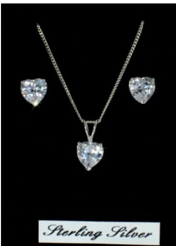
440 – Sterling Silver Crystal Heart Necklace Set £16.99