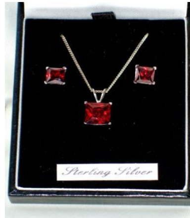
3844 – Sterling Silver Red Square Crystal Necklace Set £15.99