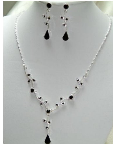
70647blk –Silver Plated Black Crystal Leaf Necklace Set £18.00