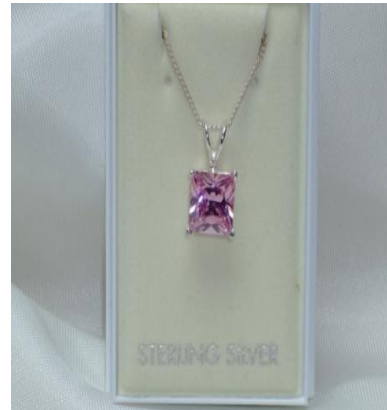
1687 – Sterling Silver Square Pink Crystal Pendant Necklace £12.99