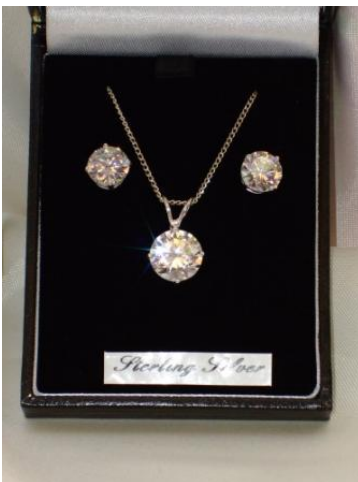
3847 – Sterling Silver Crystal Necklace Set £16.99