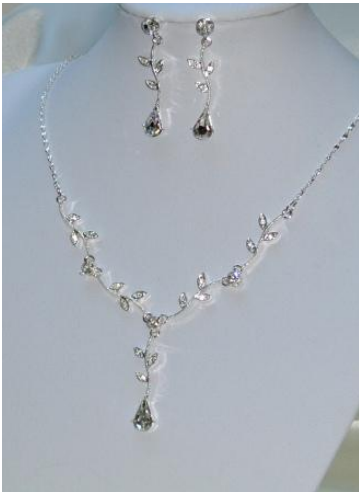
70647clr –Silver Plated Crystal Leaf Necklace Set £18.00