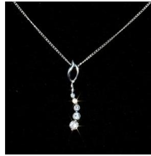
1728 – Sterling Silver Diamante Pendant Necklace £18.99