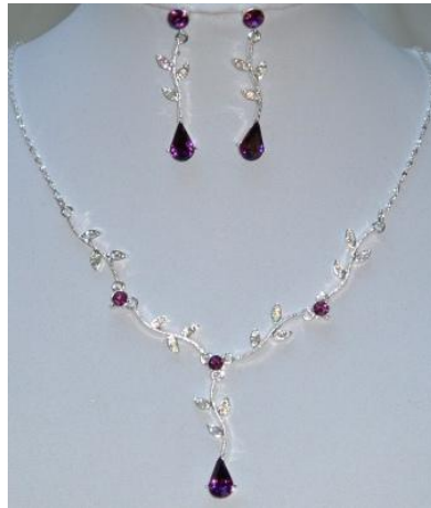
70647ame –Silver Plated Amethyst Crystal Necklace Set £18.00