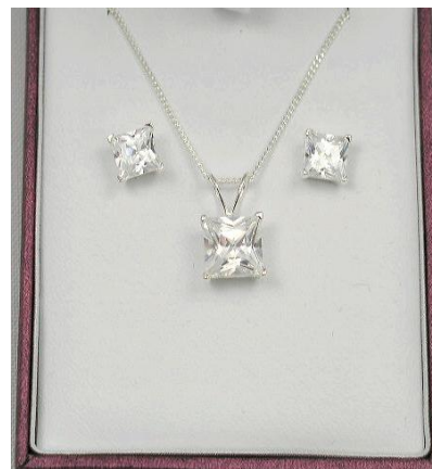
38557 – Sterling Silver Square Crystal Necklace Set £18.99