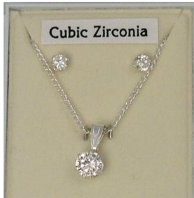
3552 – Sterling Silver Cubic Zirconia Necklace Set £14.99