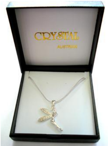
5845 – Crystal Fairy Wing Pendant & Necklace £10.99