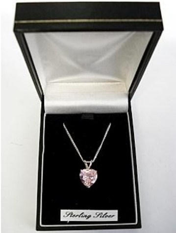
335 – Sterling Silver Pink Crystal Heart Necklace £16.99