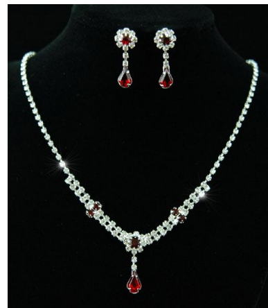
S1115 – Silver Plated Clear & Red Rhinestone Necklace Set £19.99