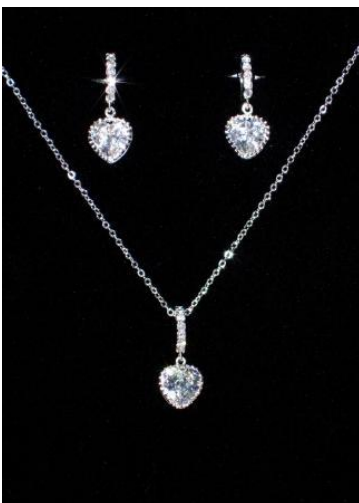
724080 –Silver Plated Crystal Heart Necklace Set £16.99