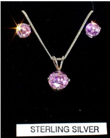
3859 – Sterling Silver Pink Crystal Necklace Set £16.99