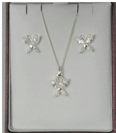
3848 –Silver Plated Crystal Butterfly Necklace Set £16.99