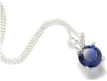
1731 – Sterling Silver Blue Crystal Pendant Necklace £16.99