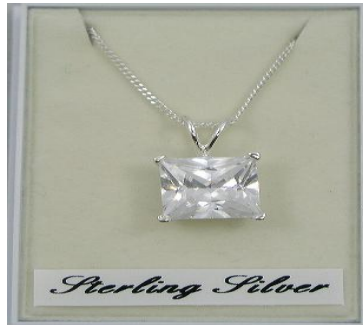
1042 – Sterling Silver Square Crystal Necklace £14.99