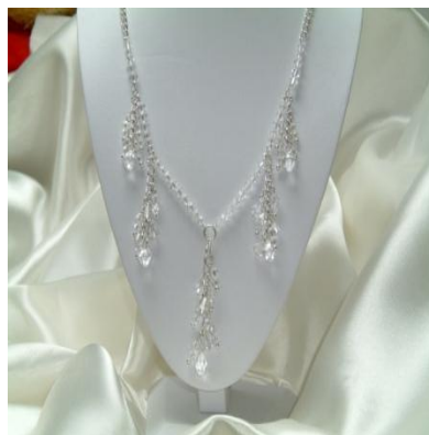
TJT0882 – Handmade Sterling Silver Swarovski Crystal Drop Necklace. £55.00