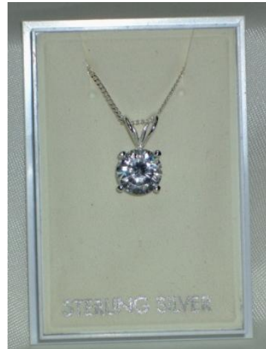
1041 – Sterling Silver Crystal Pendant Necklace £14.99