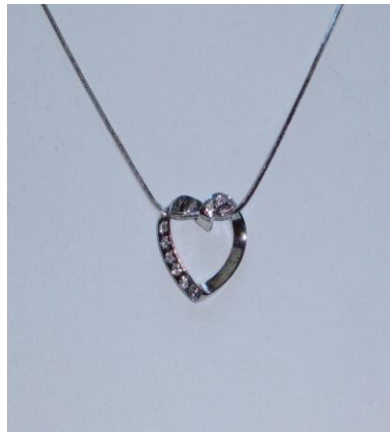
3658 – Silver Plated Diamante Heart Necklace £11.99