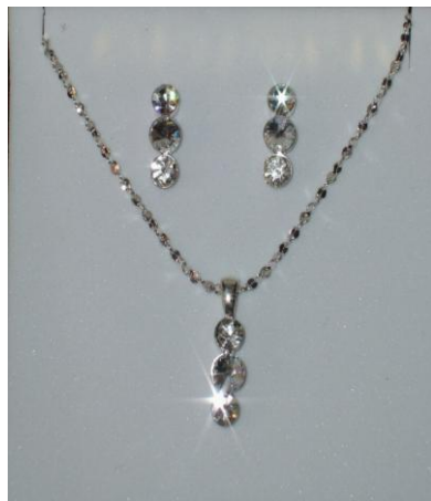
5071 – Silver Plated Crystal Drop Necklace Set £13.99