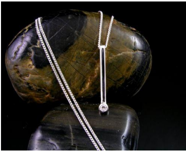
1640 – Sterling Silver Diamante Drop Necklace £14.99