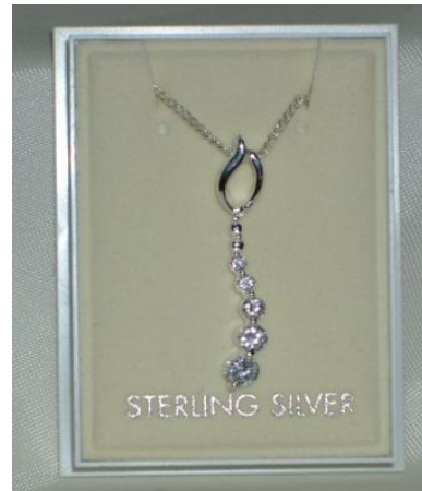
1728 – Sterling Silver Graduate Diamante Necklace £16.99