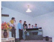
Our Choir, at our Revival