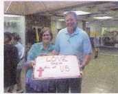
Our last day of school, when I preached, a cake was made for us. It says a lot that the Native People put a Cross on it.