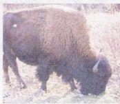
Lower Brule Sioux Reservation Where the Buffalo roam.