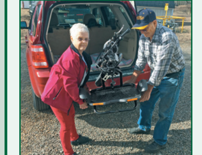
Protean Fold Up