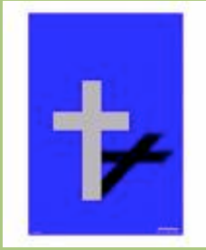
Westlake Hills Presbyterian Church