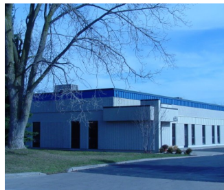
The MOST Ministries Office in Ann Arbor, Michigan.