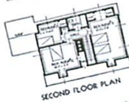
MODERN HOME No. 2284 ALREADY CUT AND FITTED

Includes all necessary material to build this lot on account of the 11 foot porch at the side. In case of a narrow lot, porch could be placed at the rear of the living room instead of at the side.