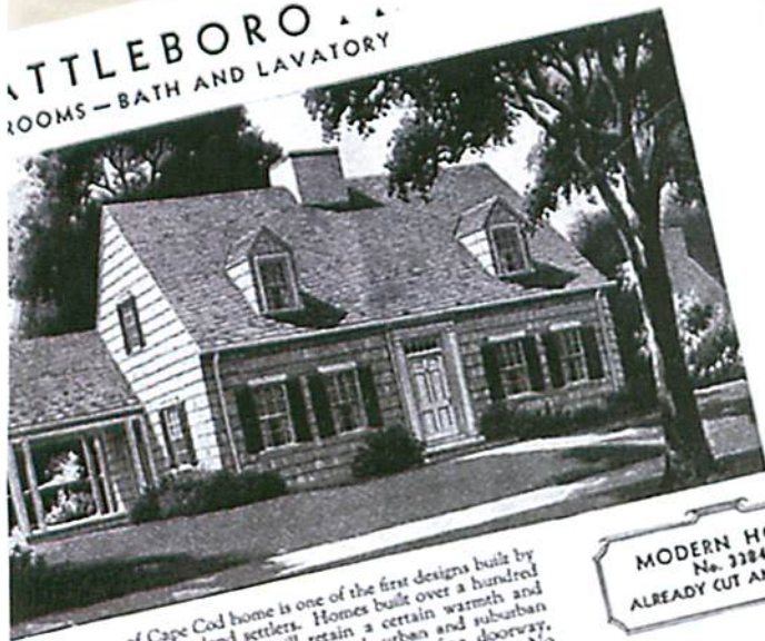
ATTLEBORO ROOMS — BATH AND LAVATORY

THIS type of Cape Cod home is one of the first designs built by the early New England settlers. Homes built over a hundred years ago grow old gracefully and still retain a certain warmth and charm. The Attleboro achieves distinction with its fine doorway, gables, shuttered windows and correct architectural details. No “gingerbread” to get out of date. Outside walls are shown of Cedar shingles, but will look equally attractive with siding.