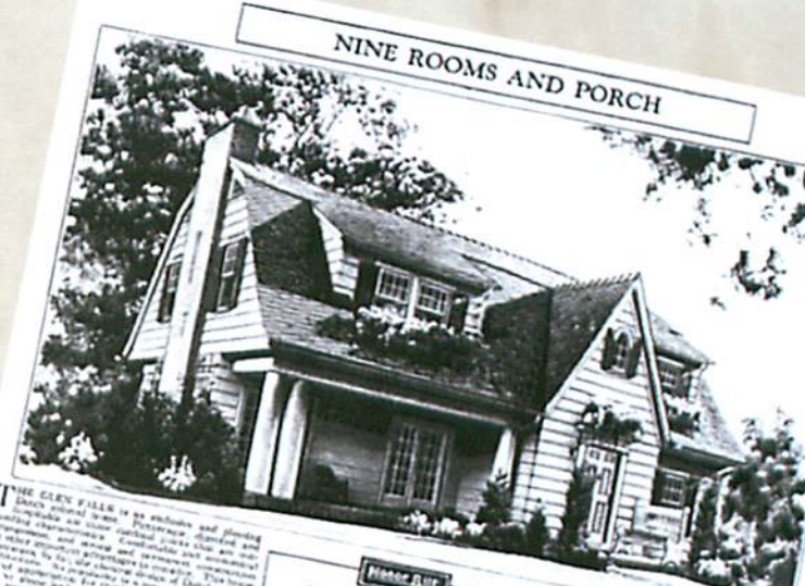
Minor Edit The Glen Falls No. 2285 "Already Cut" and Fitted $4,398.00

THE GLEN FALLS is an exclusive and pleasing building characteristic. Preference should be given to the use of the best materials and workmanship available. The Glen Falls is a charming home for the family. It is a well-planned and well-proportioned home. The Glen Falls is a well-planned and well-proportioned home. The Glen Falls is a well-planned and well-proportioned home.