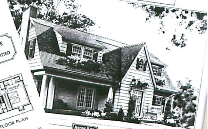
Honor Price The Glen Falls C3245 "Already Cut" and Fitted $4,398.00