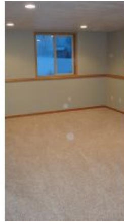
HUGE lower level 4th bedrm