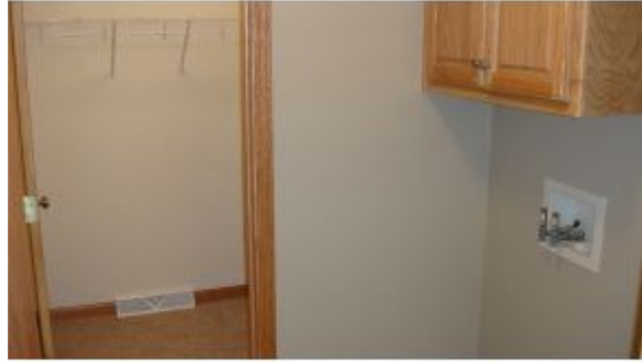
frst flr Indry w/ walkn closet