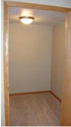
HUGE walkn clst in 4th bdrm