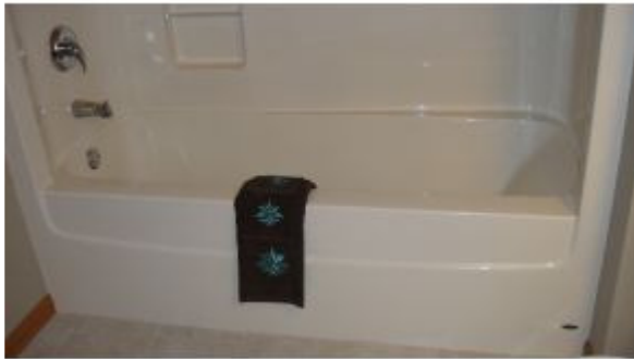
HUGE 6 ft tub in mstr bath!