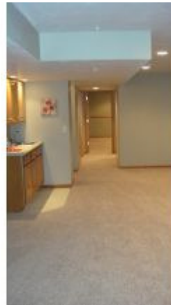
finished lwr lvl w/ wet bar!