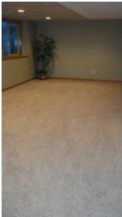
huge lower lvl family room