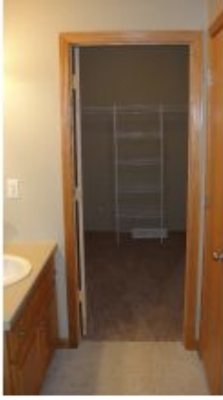
HUGE master walkin closet