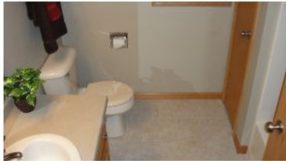
full bath 2 main floor