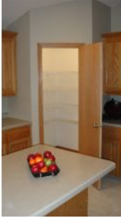
large pantry in kitchen