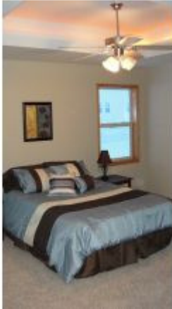
MBR w/ lighted tray ceiling