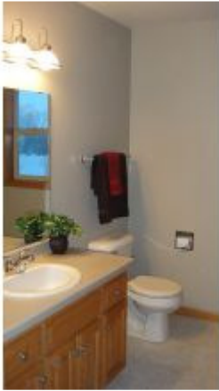
full bath 2