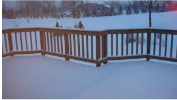
HUGE HUGE deck!