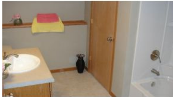
lower lvl 3rd full bathrm