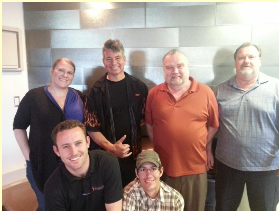
Photo of the 2014-2015 AHPBA Board