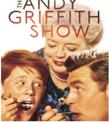
Youth Class Theme