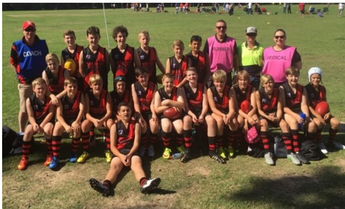
U13 vs. St Ives, Acron Oval Miranda 8.2.50 defeated St Ives 3.2.20