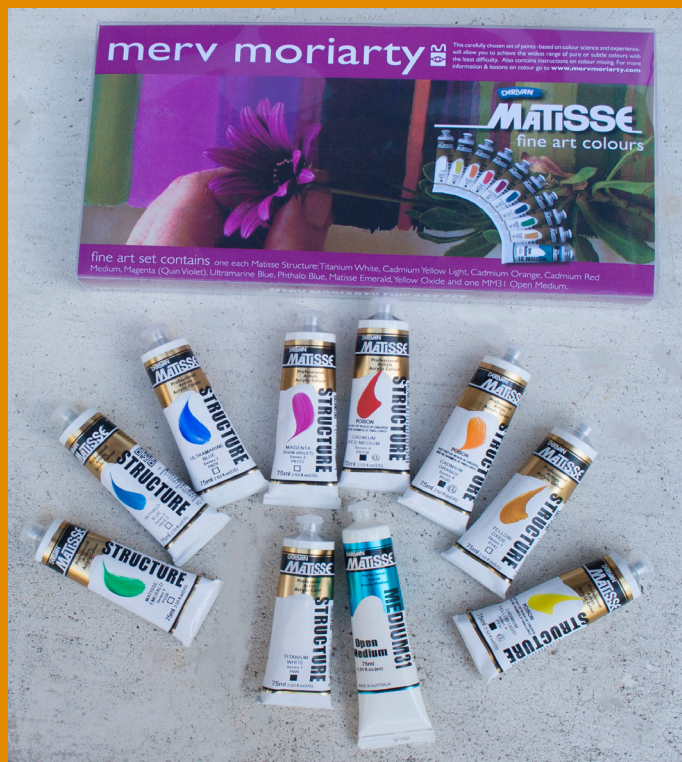
Above: Fine Art set consists of 8 colours + white + open medium

Of all mediums, Matisse Structure Acrylics provide the utmost creative flexibility, allowing for the greatest control over: transparency, translucency, opacity, surface bloom and texture. MM