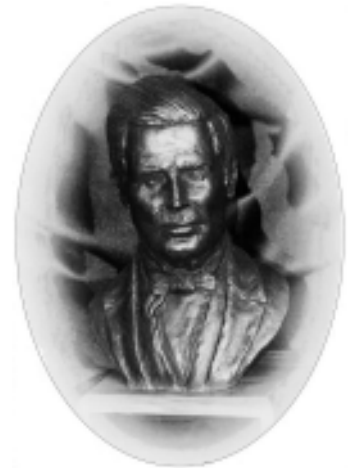
Alexander W. Doniphan bust for the Hall of Famous Missourians