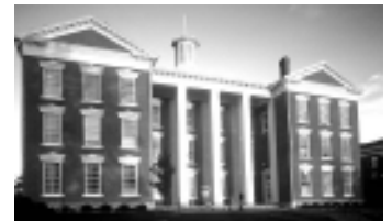
Jewell Hall on the campus of William Jewell College dates back to 1852

In December of 1836 while serving as a Missouri state legislator, Doniphan organized Caldwell and Daviess counties as a home for the Mormons. Two years later, Brigadier General Doniphan was ordered by General Lucas of the State Militia to execute Joseph Smith, Jr., founder of The Church of Jesus Christ of Latter-day Saints. He flatly refused the direct order stating that, "It is cold-blooded murder." His disobedience could have led to his own court martial. That refusal saved the lives of Joseph Smith and other church leaders who were with him.