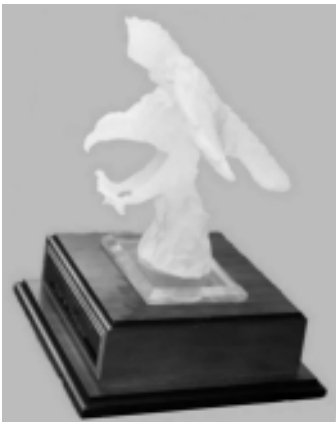
Alexander W. Doniphan Community Service Award