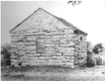
Liberty Jail where the Prophet Joseph Smith was imprisoned from December 1, 1838 through April 6, 1839