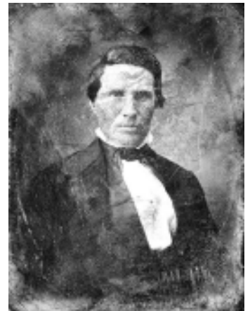
Alexander W. Doniphan

The Church of Jesus Christ of Latter-day Saints — In 1838, as a Brigadier General of the Missouri State Militia, he refused a direct order to execute Joseph Smith, Jr., founder of the Church. That action saved Smith's life and those of other church leaders. Today the Church has grown to more than 13 million members worldwide.