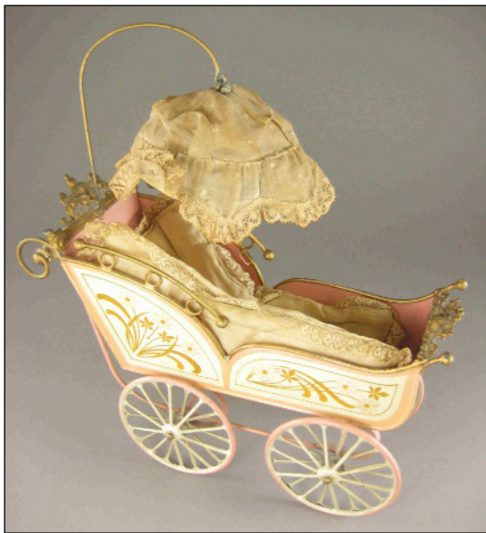
A 12-inch Marklin tin doll pram attained $5,225.