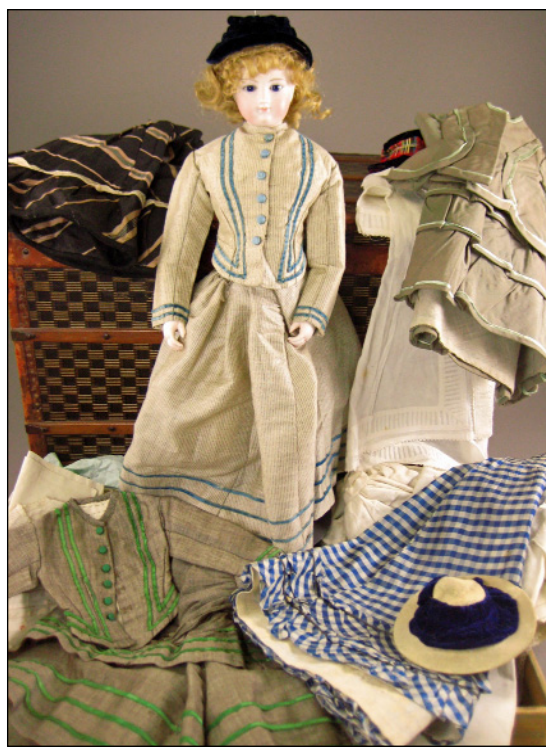
The top lot of the sale was this 18-inch French Fashion with trousseau at $5,775.