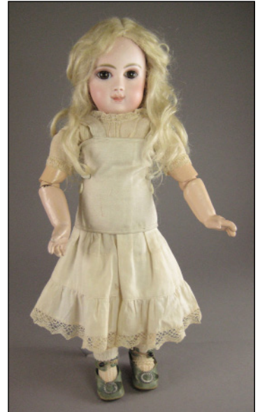
Bebes included this 15-inch Jumeau bebe portrait 2nd Series that achieved $4,060.

Speaking of all-bisques, spirited bidding pushed a 9-inch all-bisque doll with brown glass eyes and fine modeling to $1,855, immediately followed by a 4½-inch googly-eyed version, with painted and dotted eyes, for $1,485 to a persistent phone bidder.