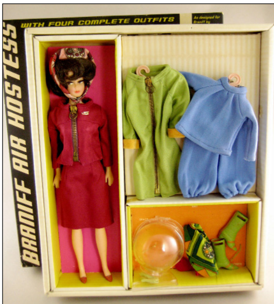
Marx Braniff Hostess fashion doll fetched $3,360.