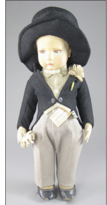
An early 16-inch Lenci boy sold for $1,740.

For additional information, www.mcmastersharris.com or 800-842-3526.