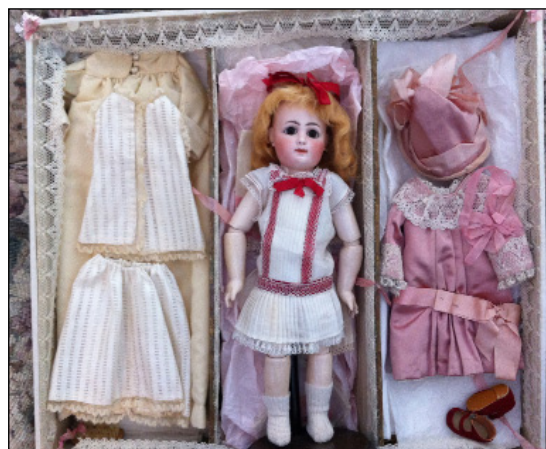
This 16-inch Raberry & Delphieu bebe with wardrobe took $3,080.

A seldom-seen German bisque head “Princess Elizabeth” marked Porzellanfabrik Burggrub/Princess Elizabeth/3½ D.R.G.M., went to an online bidder for $1,250, surpassing estimate as well. Also from Germany, the big sale of the day was not a doll at all but a Marklin tin doll pram with hanging parasol. This top seller measured 12½ inches long and 4 inches wide. It rang in at $5,225 to a satisfied phone bidder.