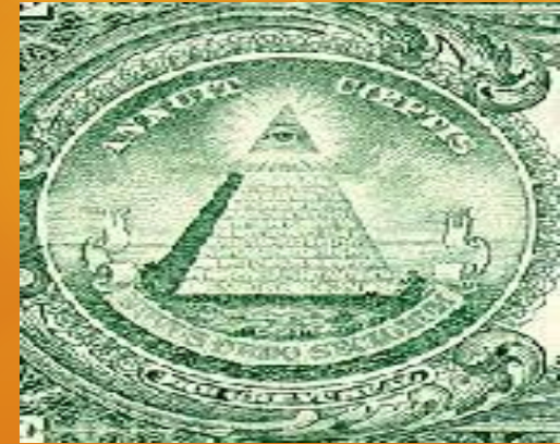
One Money System