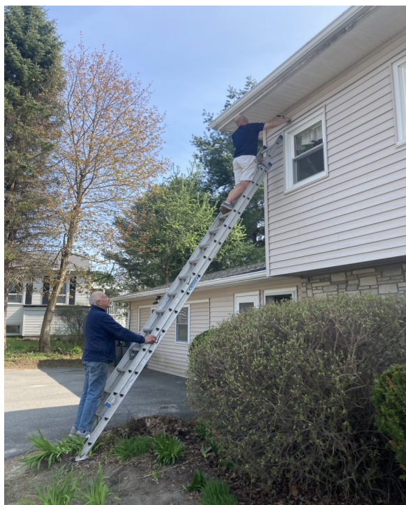
Bottom Row: Governing & Finance Members on the job.