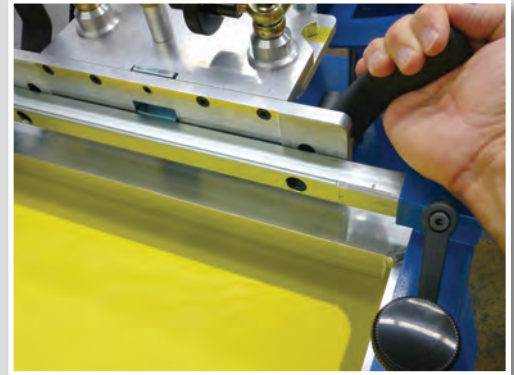
Convenient lever-actuated off-contact adjustment