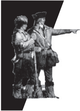
Lewis and Clark in Missouri

“Captain Lewis’s passport identified him as a ‘Citizen of the United States,’ who by the authority of the President ‘... is setting out on a voyage of discovery with the purpose of exploring the Missouri River and the western regions of the Northern Continent.’”