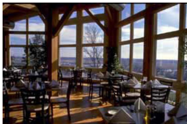
The dining room at Le Bourgeoise Restaurant overlooking the Missouri River

Please give your RSVP to Dan Sturdevant at 816.421.4783 or dan@sturdevantlawoffice.com