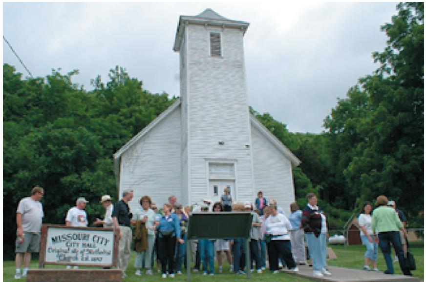
Members of the June 2, 2007, bus tour along the north side of the Missouri River, stopping at the marker at the Missouri City City Hall

Reed Karaim's article in the July/August issue of Preservation, the magazine of the National Trust for Historic Preservation, recounts the efforts of the city of Great Falls, Montana, to build a new power plant near to the site of the Great Portage. The city wants more power for development. Local historians along with Lewis and Clark trail advocates want to preserve the area. The tension between the two groups is setting the stage for a battle. The article is available at http://www.nationaltrust.org/Magazine/current/feature3.htm .