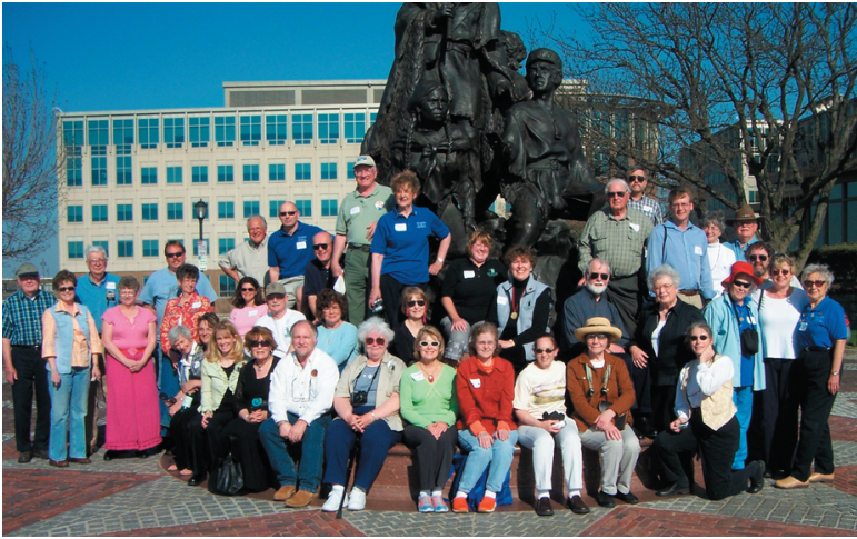
During the regional conference held on April 21, 2007, attendees posed at Lewis and Clark Point at 8th and Jefferson in Kansas City.