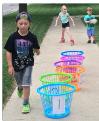
Wednesday, June 8, was a fine evening for activities after the grill out at 5:45 and worship at 6:30pm.