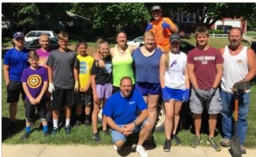
Tuesday, June 21, Youth Service Project – Youth and adult volunteers cleaned up landscaping around the church.