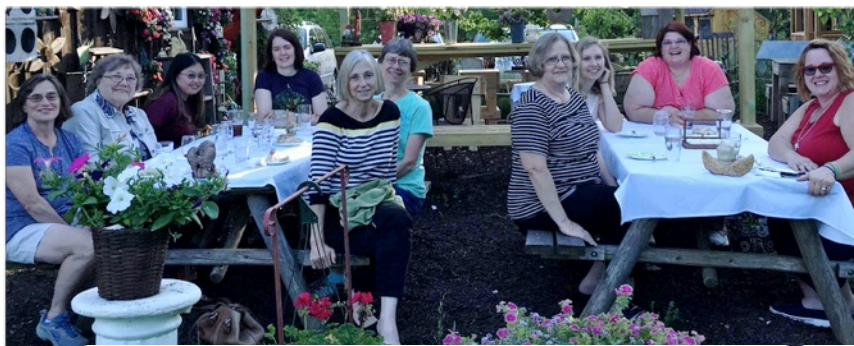
WomenWineWisdom met June 2 at the Farmer's Daughter's Market.