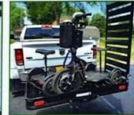
Aluminum Scooter Carrier