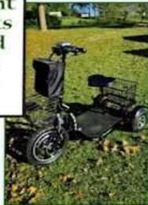
1000W AWD Standard

This scooter is designed for everyday use!