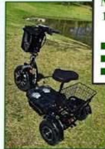
1600W AWD Kodiak