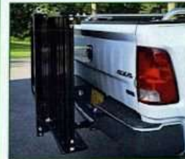
Folds Up Easily