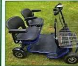
Colors: Red, Blue, Yellow and Purple

This scooter is designed for off-road use... deer hunting, construction yard, parking lot security