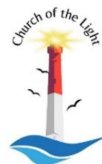
ZION LUTHERAN CHURCH Barnegat Light NJ

© 1982 Integrity's Hosanna! Music, CCLI License # 22085334