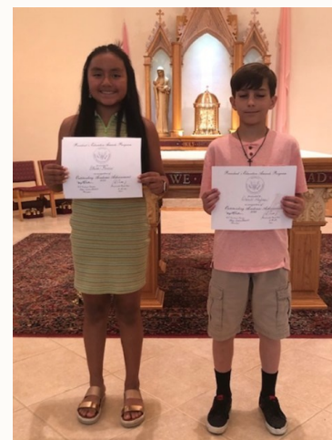
Presidential Academic Achievement Awards