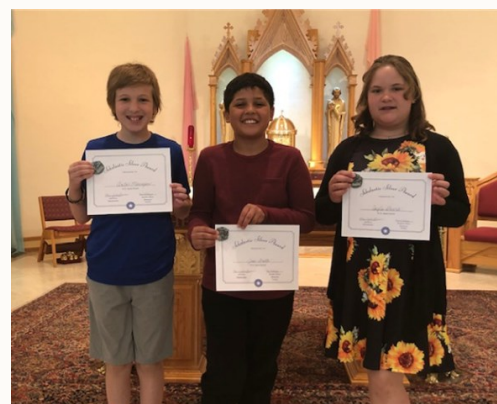
Presidential Academic Excellence Scholastic - Silver Awards