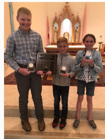
Virtuous Students of the Year Award