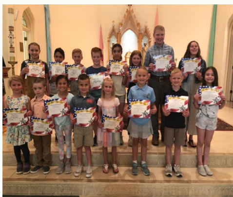
Classroom Citizenship Awards