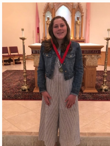
Top Scholar Award