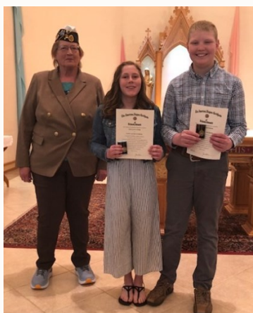
American Legion Citizenship Award