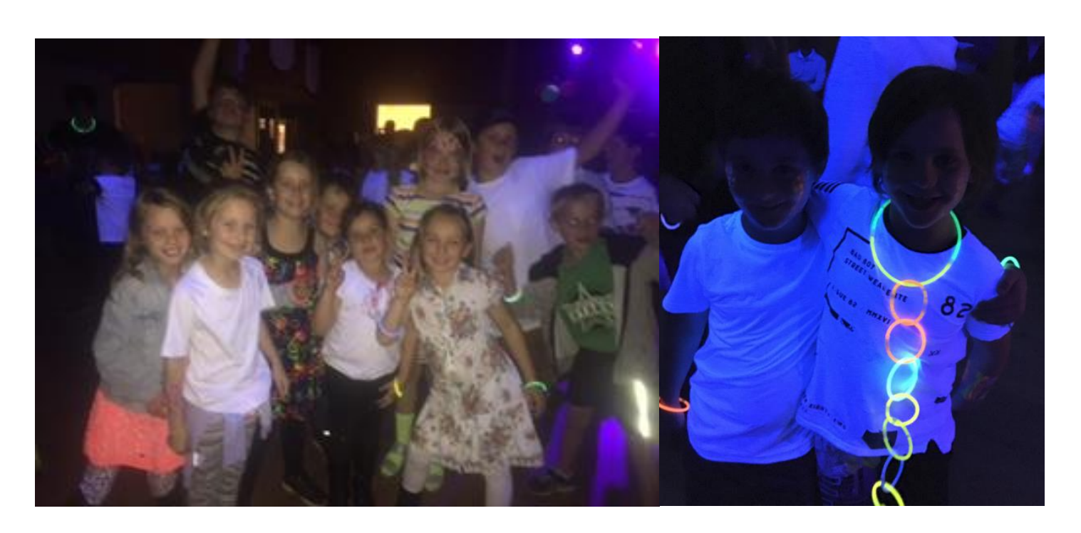
Thankyou PFA and SRC for the best music, the best lights and the best food!!!