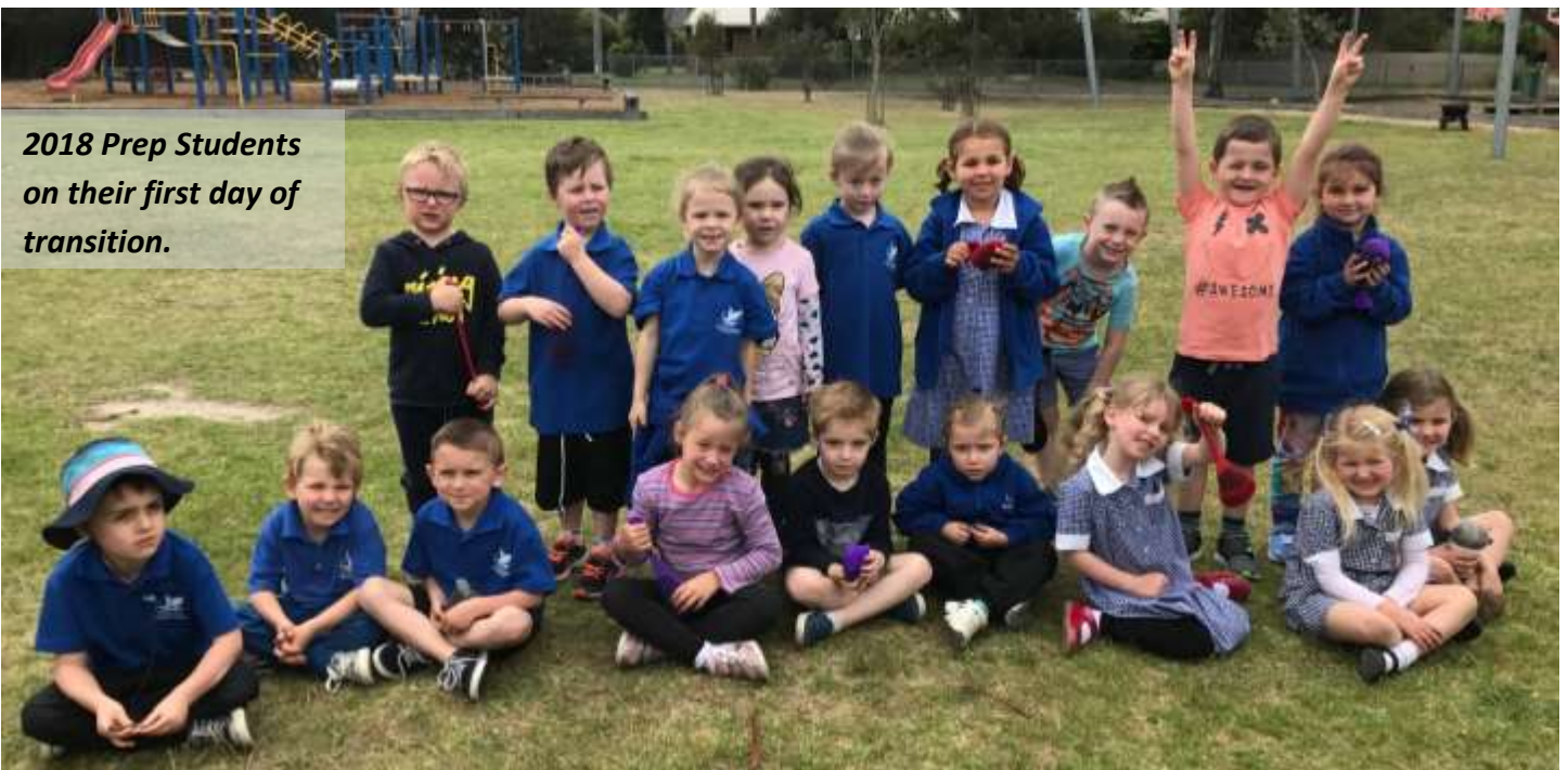
2018 Prep Students on their first day of transition.