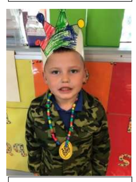
Mayhem – When I am 100, I will go to the park.