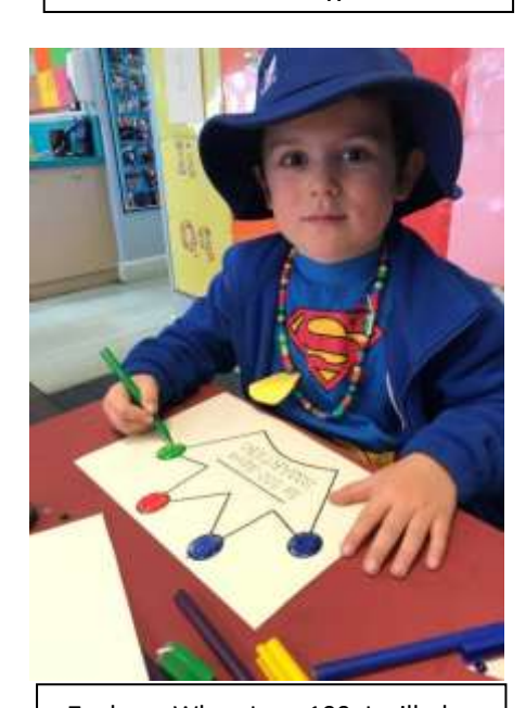
Zealan – When I am 100, I will play all day.