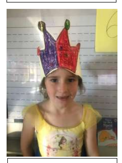
Iley – When I am 100, I will watch movies.