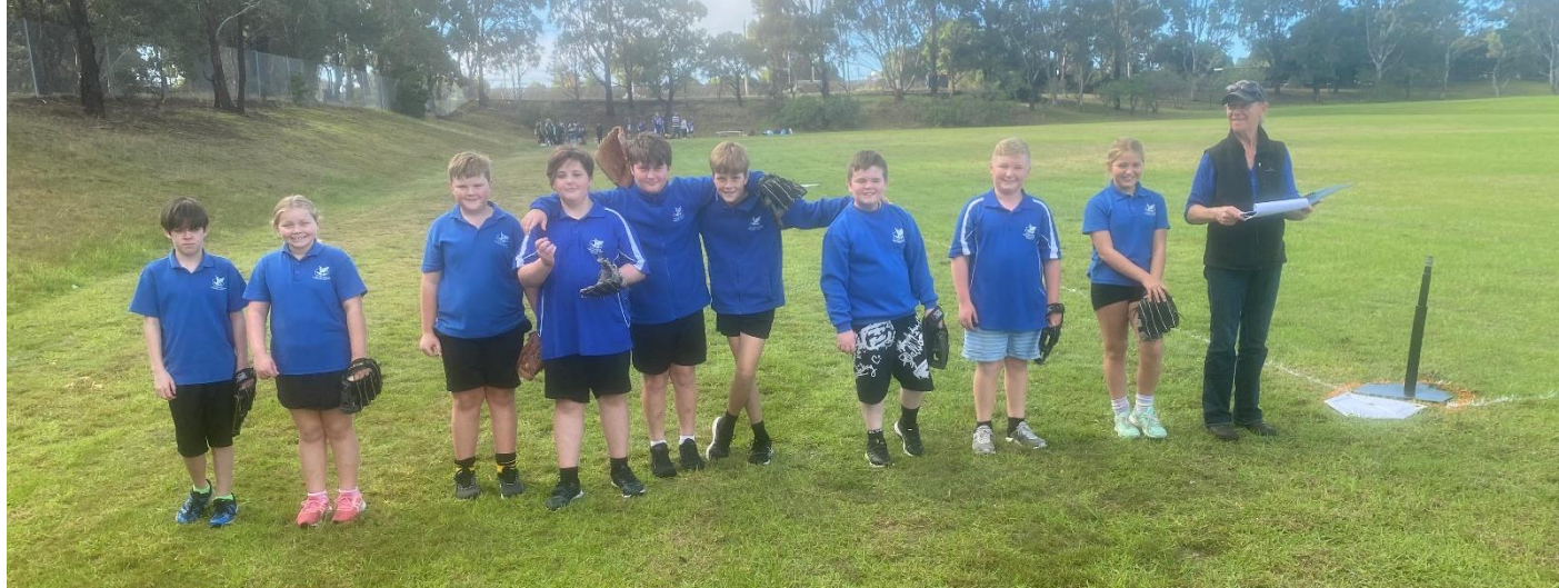
Do it for Dolly Day