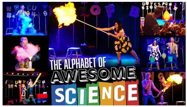
The Alphabet of Awesome Science Show