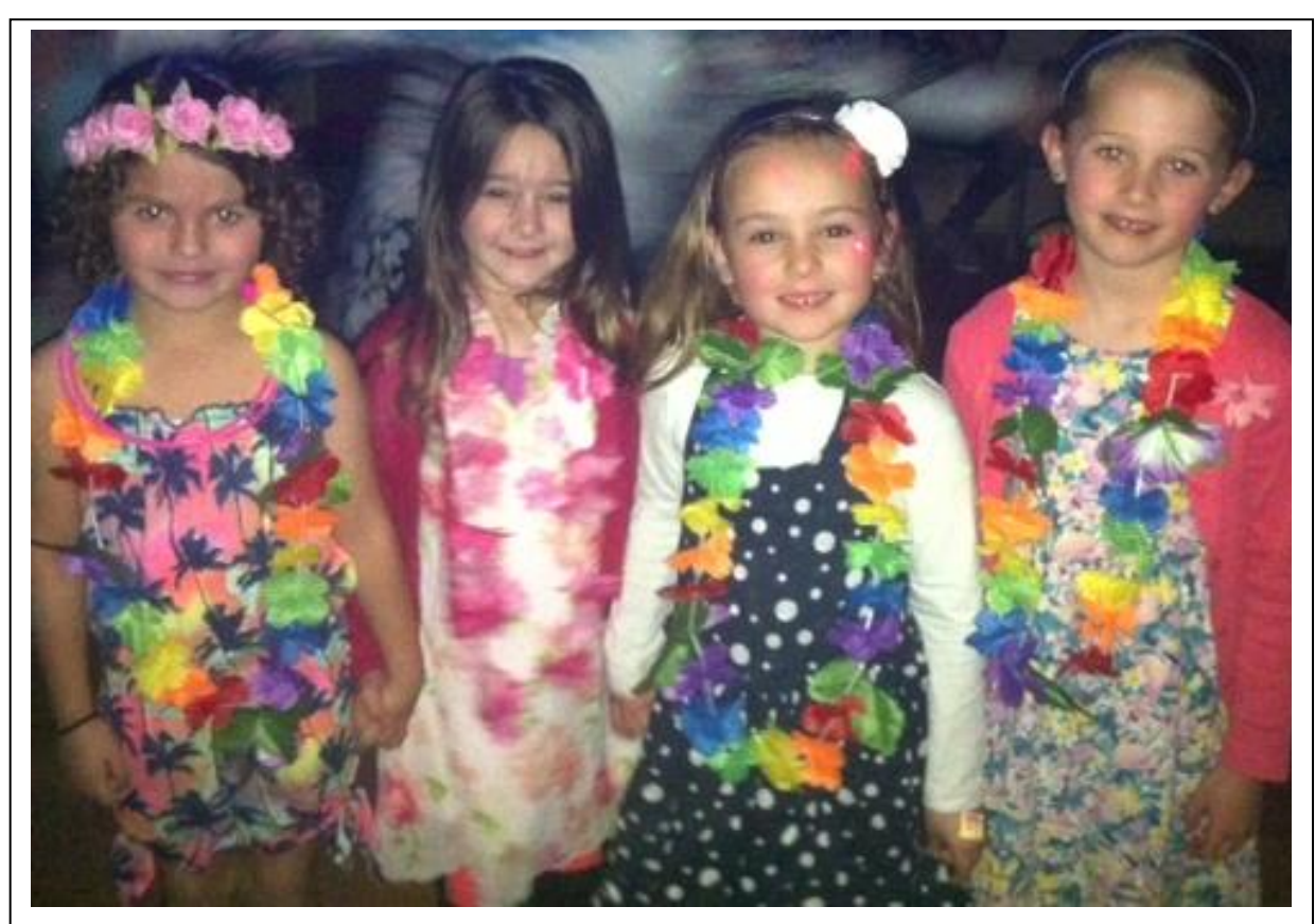
DISCO Night - Hawaiian Style