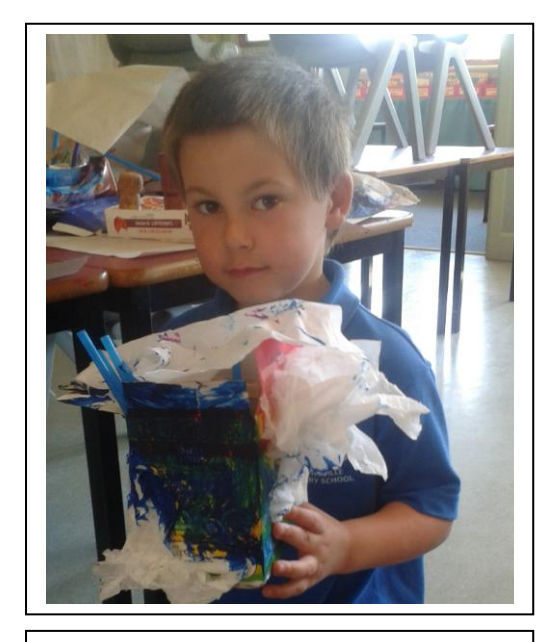
Questacon Science Centre Comes to School

The prep grade have been very busy this week making models of the Little Pigs' houses. They worked through the whole design and build process themselves and they all managed to create some excellent buildings. Despite some trouble with contractors and building permits, all of the preps said they would have a go at owning a building in the future.