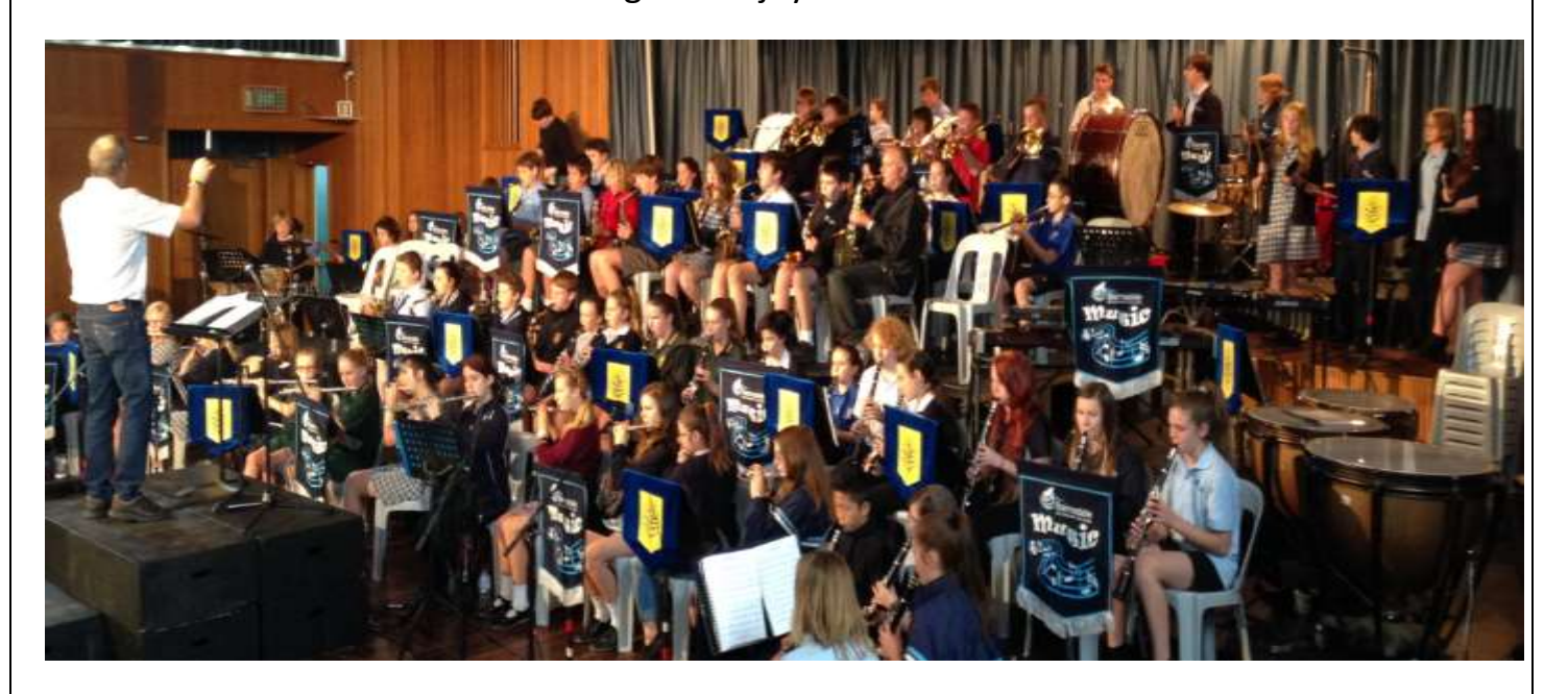
The Orchestra in full flight!

At assembly on Monday a number of our music students will be demonstrating their instrument to the school. Come along and enjoy the show.