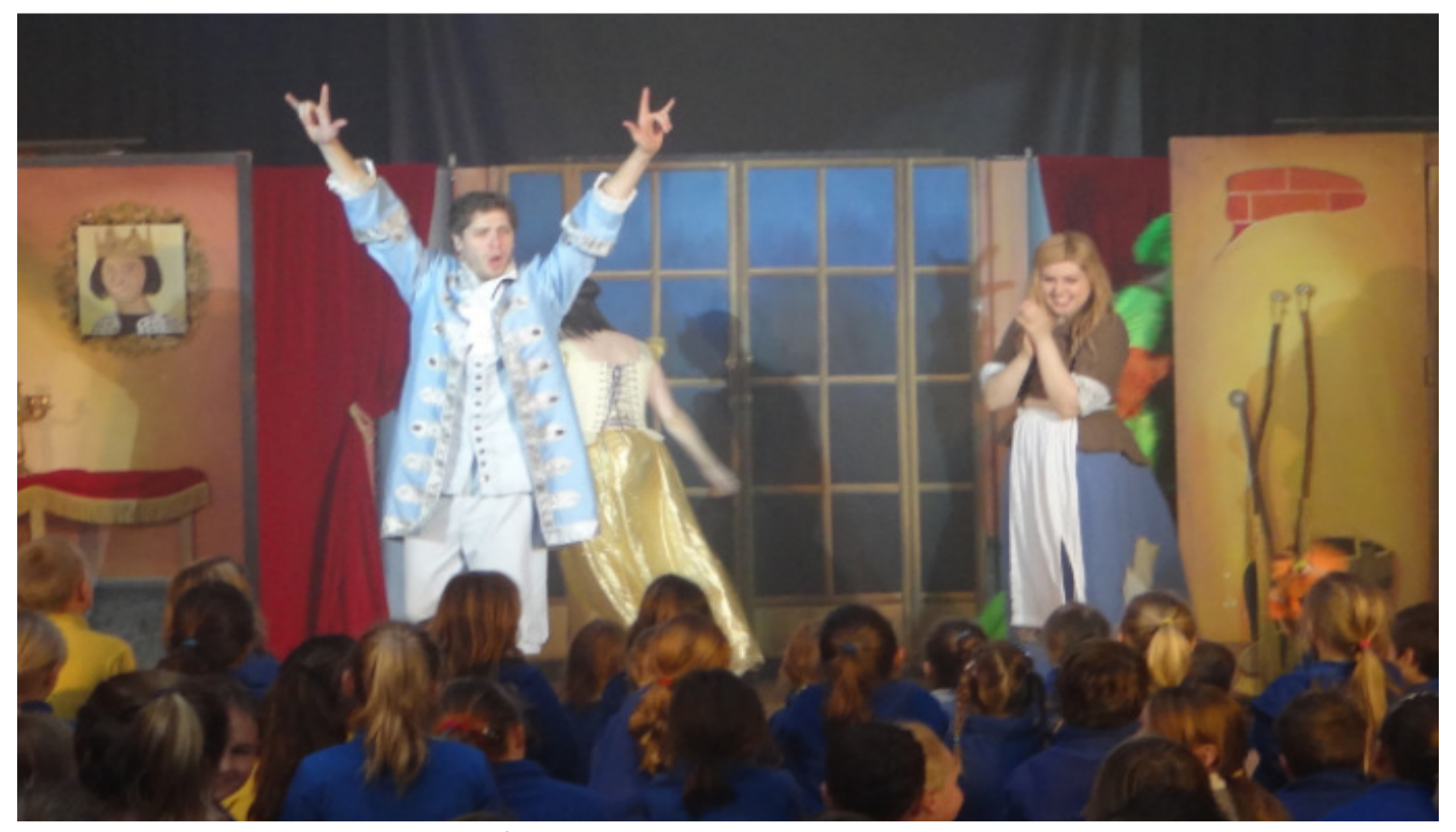
Cinderella went to the ball and found her Prince!

Cinderella came to Paynesville on Wednesday. The show was fantastic and students from all ages loved everything about it. Cinderella had a very busy day at Paynesville.