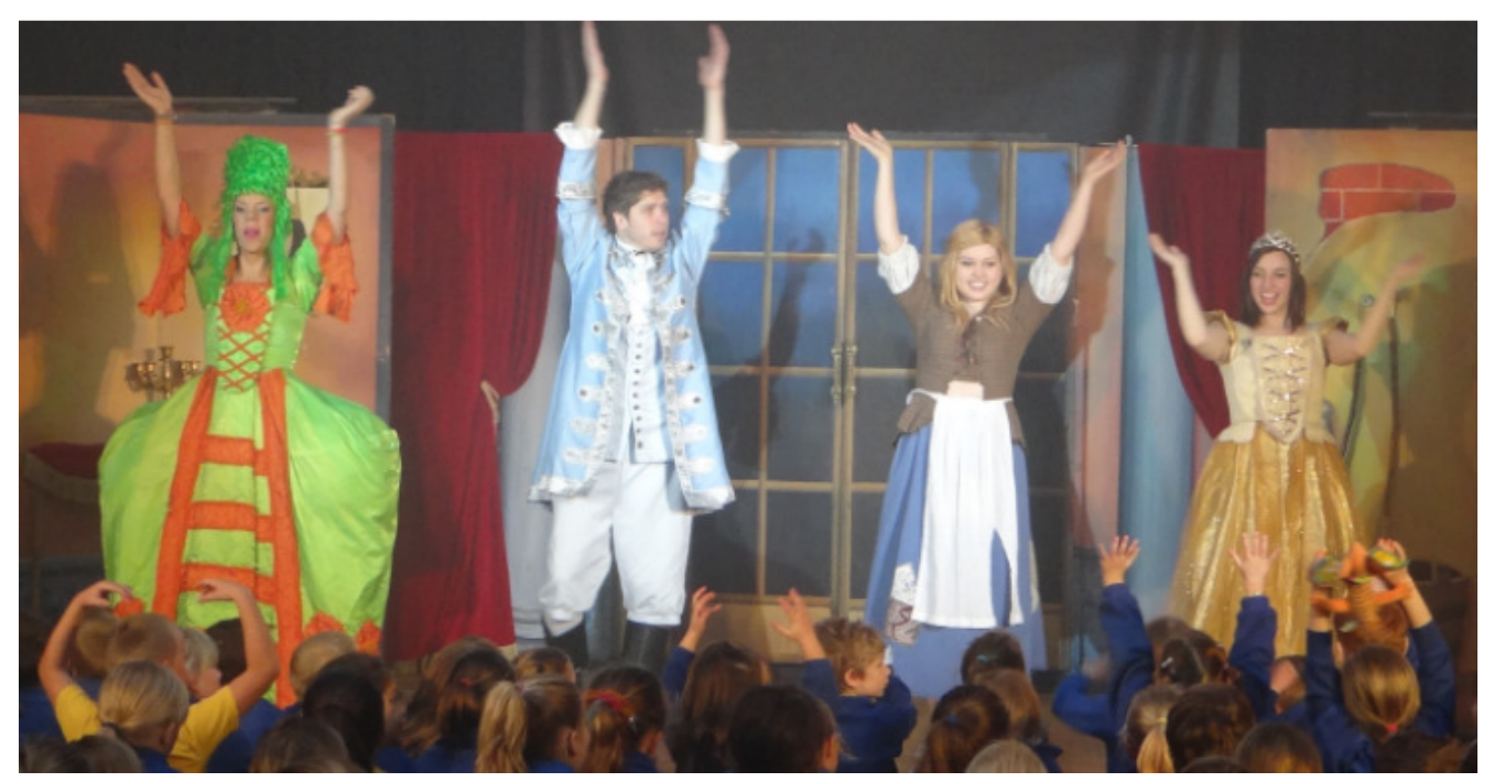
She married him and she was about to live happily ever after ....when