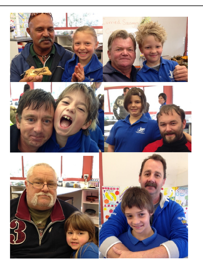
Grade 3 Father's Day Starfish Gifts