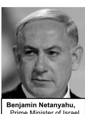
Prime Minister of Israel

tax dollars, the U.S. Gov'mt was never serious about a two-State solution for Gaza and the West Bank. Keep in mind that the CIA has worked hard to prevent the spread of democracy. Our annual military aid to Israel is an extension of the QUIET U.S. war policy, to create enemies for war, for the military industrial complex. And hence, again, U.S. foreknowledge of Oct. 7.