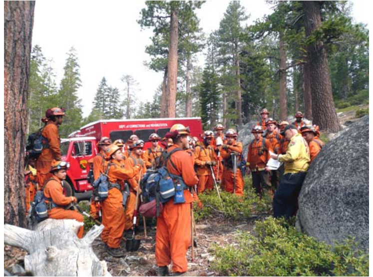
Members of the Pine Grove Fire Camp assemble for instructions for the day. The Pine Grove crew was joined by hundreds of other inmate firefighters from across the state to fight the Angora Fire near Lake Tahoe. The Pine Grove crew was dispatched on June 24, and we returned to Pine Grove on July 2. The fire burned more than 3,000 acres, destroyed 242 homes, 67 additional buildings and damaged 35 another homes.