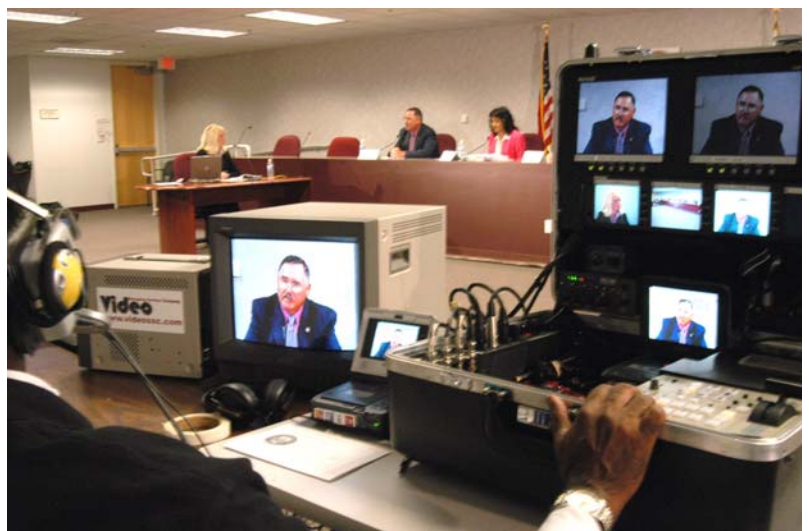
The Webinar used live streaming video to detail reentry plans.