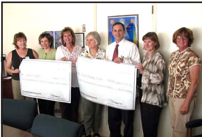
El Paso de Robles Youth Correctional Facility raised $3,400 during National Crime Victims' Rights Week for two organizations in San Luis Obispo County. checks were presented to the North County Women's Shelter and the San Luis Obispo County Child Abuse Prevention Council. Each agency received $1,700.