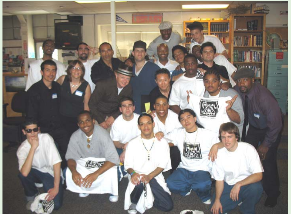
Wards pose with members of the Unusual Suspects Theatre Company .

The effort was made possible through an alliance with the Southern California-based Unusual Suspects Theatre Company — a non-profit organization of professional artists who work to bring theatre arts to youth, ages 12-21, from the foster care and juvenile justice systems. The wards spent seven weeks with the theatre company, learning the basics of theatre, script writing and role-playing.