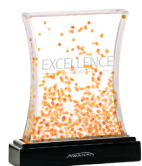
Excellence Second Book Award