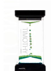
Timothy Fourth Book Award