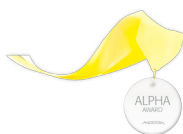
Alpha First Book Award