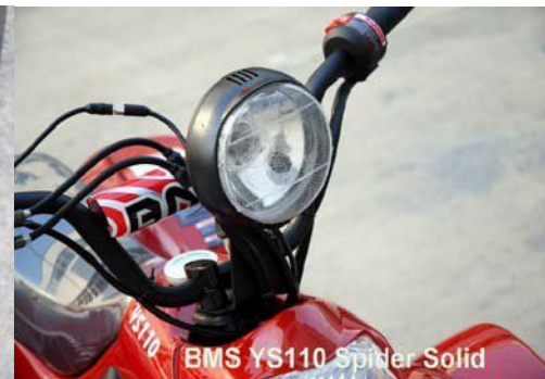
BMS YS110 Spider Solid