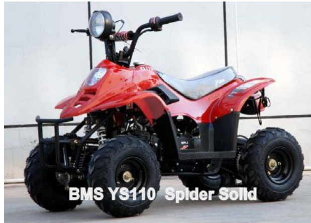
SOLID - RED