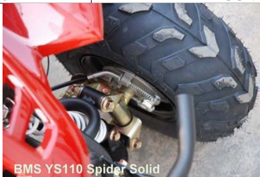
BMS YS110 Spider Solid