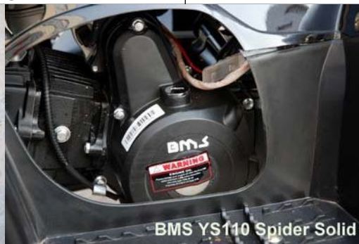
BMS YS110 Spider Solid