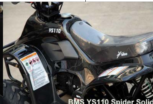
BMS YS110 Spider Solid