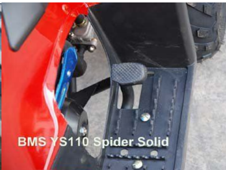
BMS YS110 Spider Solid