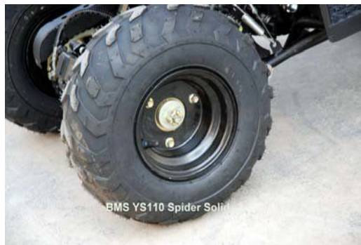
BMS YS110 Spider Solid