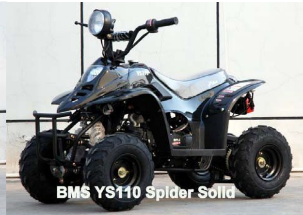
SOLID - BLACK