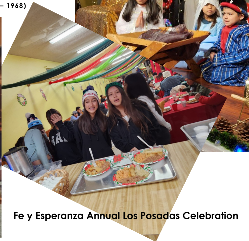
Fe y Esperanza Annual Los Posadas Celebration