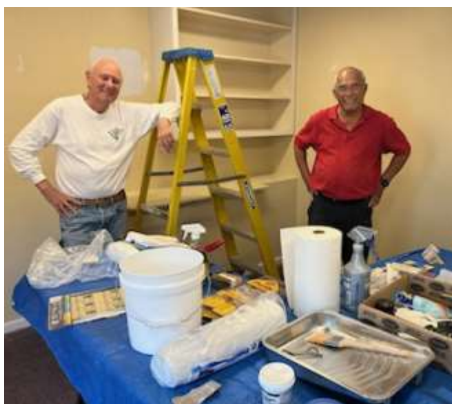
Servant leaders — joyfully answering God’s call and through God’s grace, supporting our pastor and congregation in so many ways.